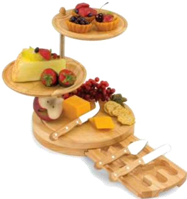
Set of cheese trays and knives in wood with stainless steel. 1-2 weeks production time for private label.