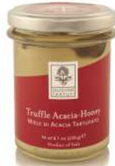
Truffle honey, 8.1 oz Code 215-1