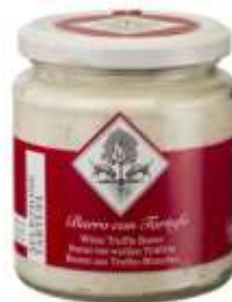
White truffle butter, 2.8 & 8.8 oz Code 216-0 & 216-1