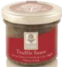
Truffle sauce, 3.2 oz Code 203-0