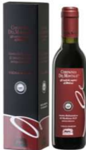
“Vigna Bordo” 8.5 fl oz—Code 302-1