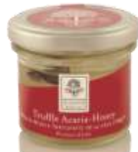
Truffle honey, 3.6 oz Code 215-0