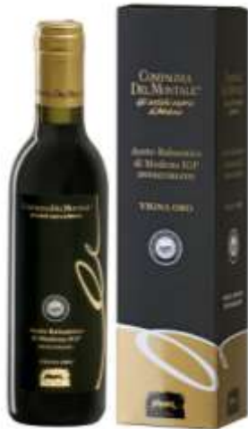
“Vigna Oro” 3.5 fl oz—Code 301-0 8.5 fl oz—Code 312-1