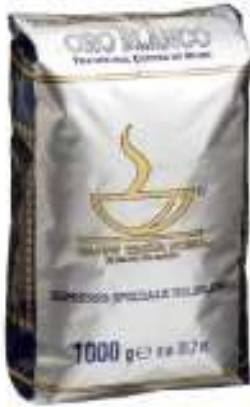
Oro Blanco HO.RE.CA espresso beans, 2.2 Lb code 10130