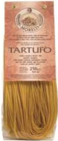
Tagliolini w/ truffle, 8.8 oz code 21118