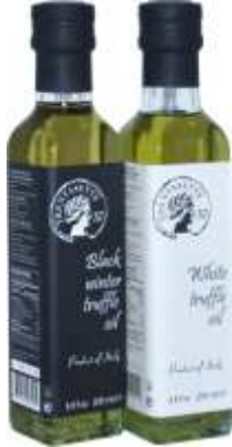
“Trentasette” - an Italian Products’ brand