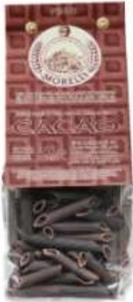
Cocoa penne, 8.8 oz c 17135