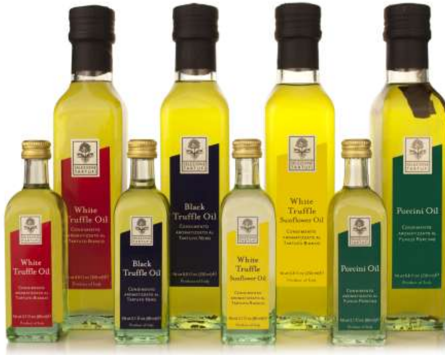
“Selezione Tartufi” white truffle oil, black truffle oil, white truffle sunflower seed oil, & porcini oil. 2.1 fl oz & 8.8 fl oz