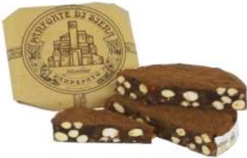
“Marabissi” Panpepato code 103