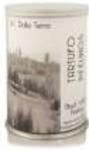
Truffle Peelings c 271-X