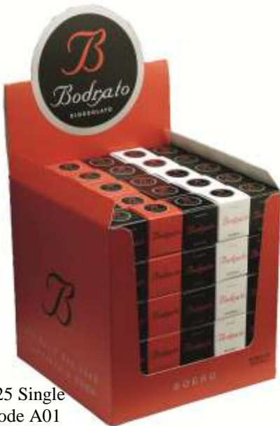
125 Single Code A01