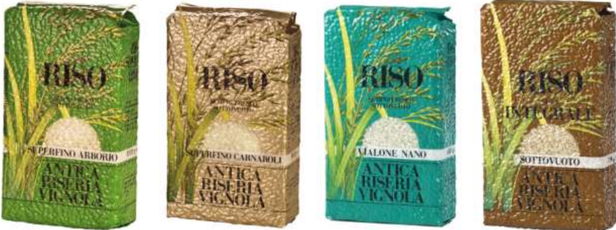
“Antica Riseria’ Arborio 604-X, Carnaroli 605-X, Vialone Nano c 606-X, Integrale 606-X