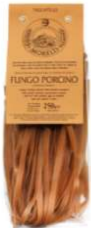
Tagliatelle w/ porcini mushrooms, 8.8 oz code 11122