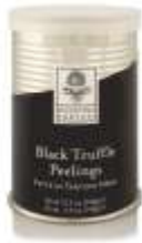
Truffle Peelings c 241-2