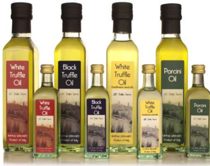
“D Dalla Terra” white truffle oil, black truffle oil, white truffle sunflower seed oil, & porcini oil. 2.1 fl oz & 8.8 fl oz