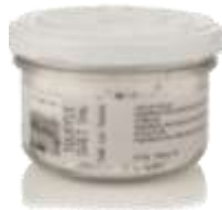
Truffle salt 5%, 3.5 oz & 2.2 Lb Code 258-0 & 2