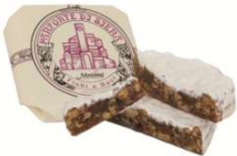
“Marabissi” Panforte Fig & Walnuts code 106