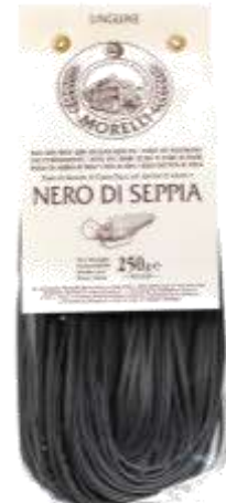
Linguine squid ink, 8.8 oz code 9120