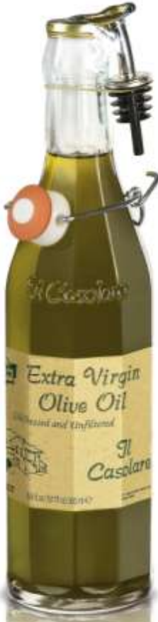
"Il Casolare" EV, Unfiltered Olive Oil 17 fl oz Code 516-0 & 32 fl oz Code 516-2 (no spout)