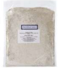
Truffle salt 5% & 10%, 2.2 Lb See page 6 for info