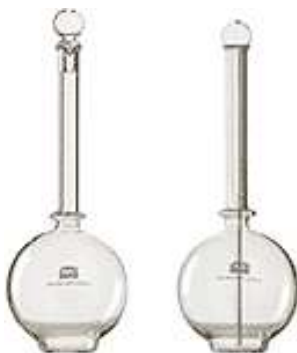
“Gemelli ” 8.5 fl oz cap—Code 908-0