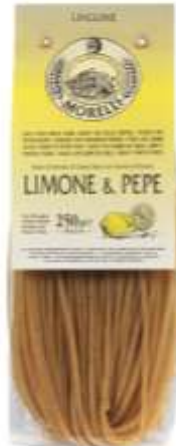
Linguine lemon & pepper, 8.8 oz code 28120