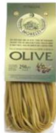
Fettuccine w/ olives, 8.8 oz code 27123