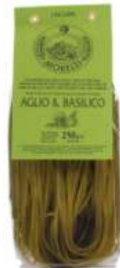
Linguine w/ garlic & basil, 8.8 oz code 14120