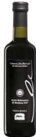
“Vigna Bianca” 17 fl oz—Code 303-2 5 liters—Code 303-3