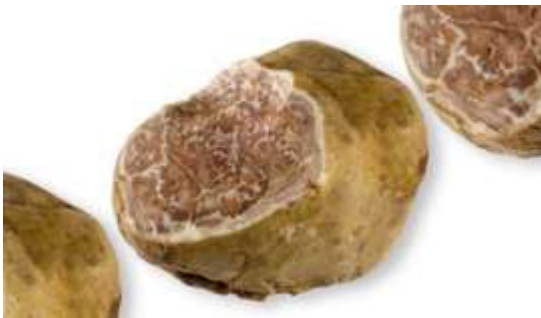
White Winter Truffles (Alba) - Tuber Magnatum Pico