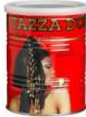
"Speciale Arabica" ground espresso 8.8 oz