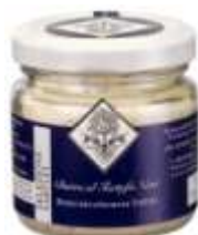
Black truffle butter, 2.8 & 8.8 oz Code 217-0 & 217-1