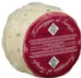
Truffle cheese, Abt 1 Lb Code 219-0