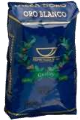
Oro Blanco Bar espresso beans, 2.2 Lb code 10131