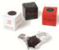
"I Boeri" grappa dipped, chocolate covered cherries NOT PITTED, in display case or cube.