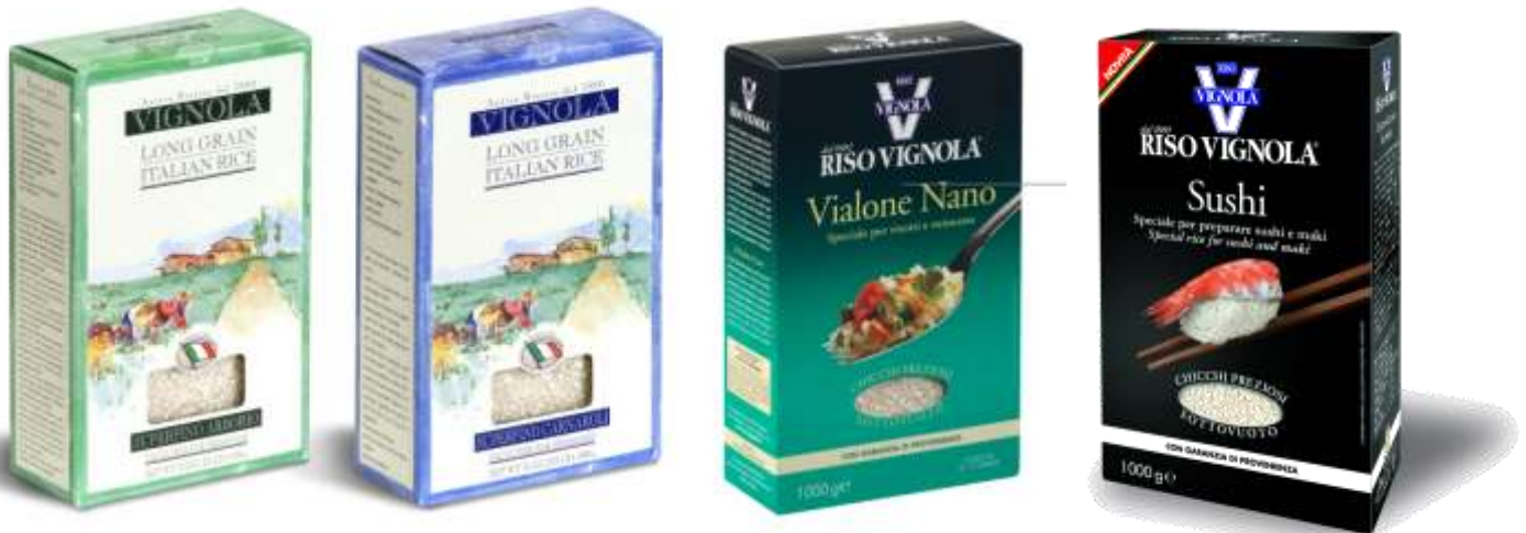
“Vignola” 2.2 or 11 Lb Arborio c 604-1 or 2, Carnaroli c 605-1 or 2, Vialone Nano c 606-1 or 2 And our new Sushi rice, available from August 2011.