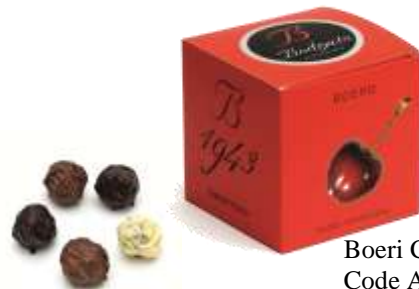
Boeri Cube 7 oz Code A04 & 5