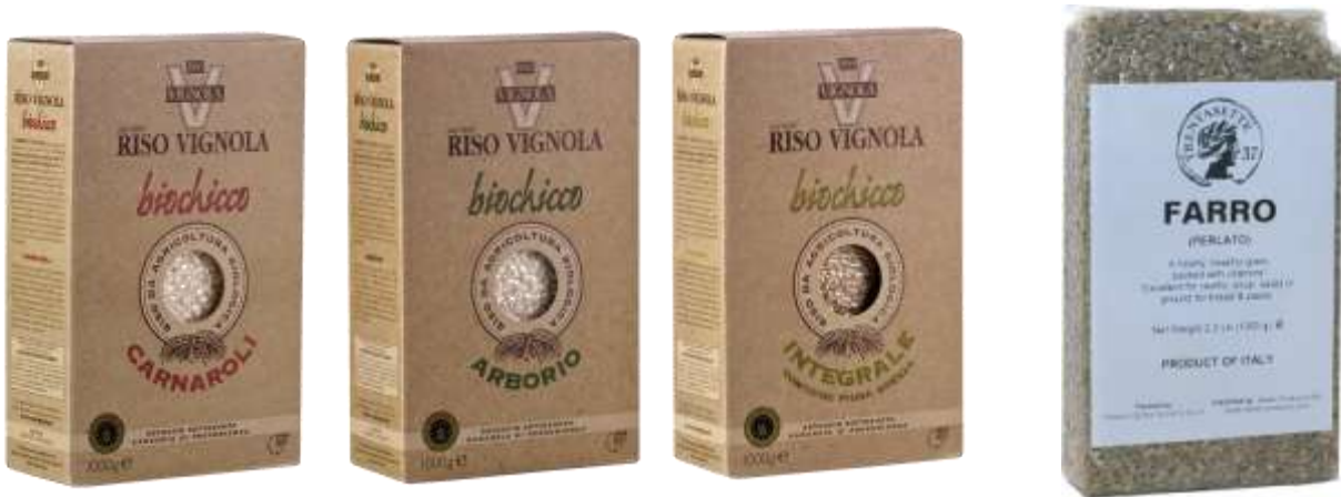
“Biochicco” Organic Arborio 604, Carnaroli 605, Integrale 606 “Trentasette’ Farro grains 613