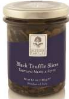
Black truffle slices, 6.4 oz Code 223-1