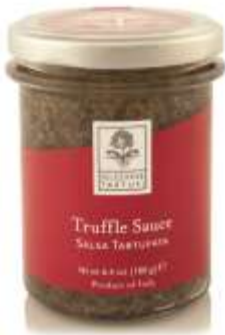
Truffle sauce, 6.4 oz & 1.1 Lb Code 203-1 & 2