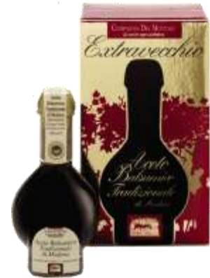
Tradizionale “Extra Vecchio” 3.5 fl oz—Code 306-0