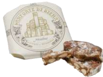
“Marabissi” Panforte Dates & Almonds code 107