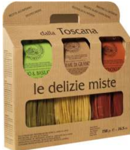
Trio of pasta gift box with plain, peperoncino & basil&garlic pasta, 3x8.8 oz code 3200