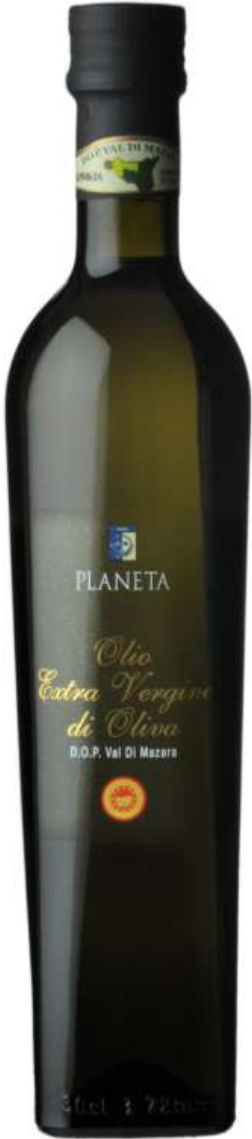
"Planeta" EV Olive Oil Oil DOP Val di Mazara, 17fl oz code Code 510-1