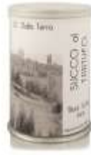
Truffle Juice c 273-X