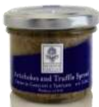
Artichoke & truffle spread, 3.2 oz Code 209-0