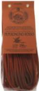
Linguine w/ peperoncino, 8.8 oz code 4120