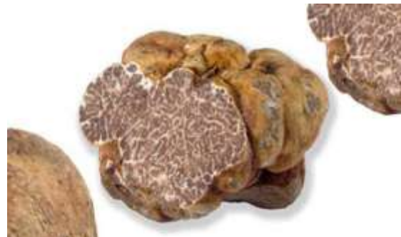
White Spring Truffles (Bianchetto)- Tuber Borchii Vitt.