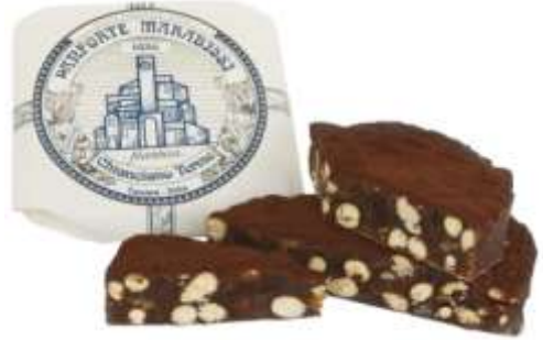
“Marabissi” Panforte Nero code 101