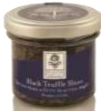
Black truffle slices, 3.2 oz Code 223-0