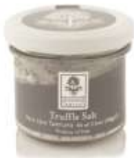
Truffle salt 5%, 3.5 oz & 2.2 Lb Code 256-0 & 2