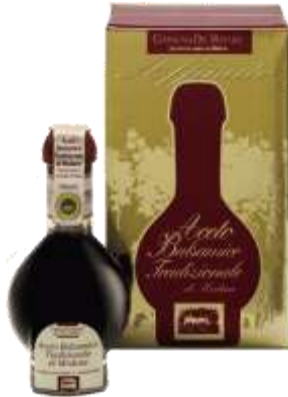
Tradizionale “Affinato” 3.5 fl oz—Code 305-0