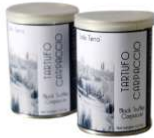
“D Dalla Terra”- an Italian Products’ brand