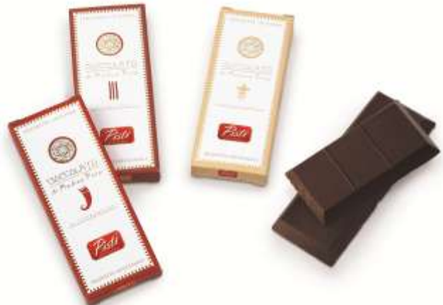
"Modica" chocolate w/ cinnamon code 1001