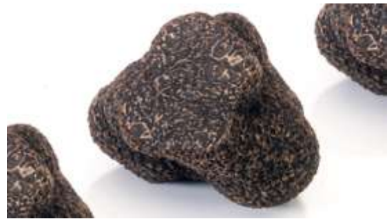
Black Winter Truffles (Norcia) - Tuber Melanosporum