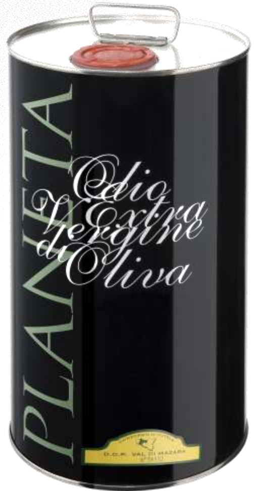
“Planeta” EV Olive Oil DOP Val Di Mazara, 5 liters C 510-3

Serving Suggestions: Our Planeta Olive Oil is wonderful paired with hearty vegetables, meats, meatier and rich fish, carpaccio, salads, pastas and wherever you desire a round, distinctive olive oil finish to your dish.