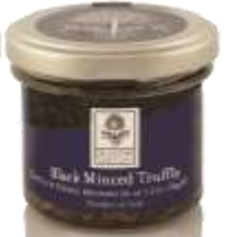
Black truffle paste, 3.2 oz Code 233-0