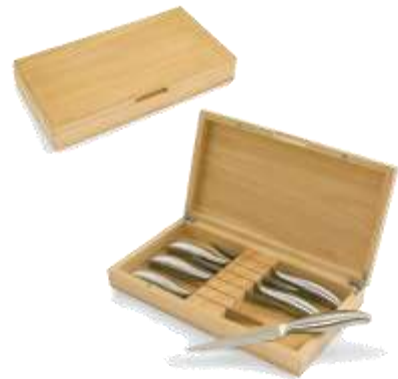
Set of 6 stainless steel steak knives in wooden box