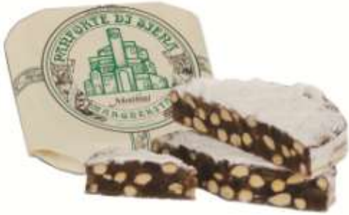
“Marabissi” Panforte Margherita code 102