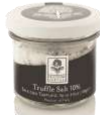
Truffle salt 10%, 3.5 oz & 2.2 Lb Code 257-0 & 2