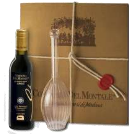
“Gift Box Vigna Oro” 8.5 fl oz—Code 330-0