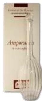
“Amporaccio OR” 8.5 fl oz cap—Code 902-0