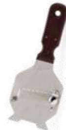
Truffle shaver in stainless steel with wooden handle. 2 months for private label. Also available with supplier’s brand.