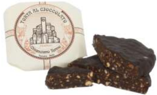
“Marabissi” Torta al Cioccolato code 104