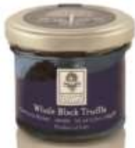
Whole black truffles, 1.4 oz Code 208-0