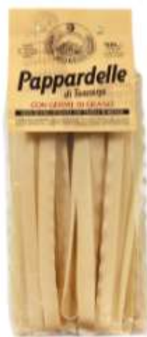
Pappardelle plain wheat germ, 1.1 Lb code 2213