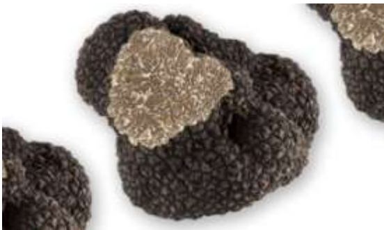
Black Summer Truffles - Tuber Aestivum (Scorzzone)