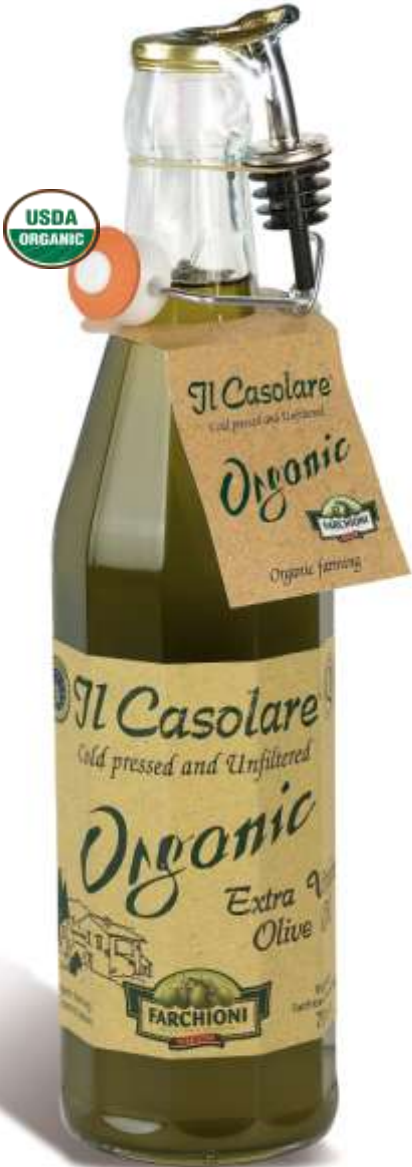
"Il Casolare" EV Organic, Unfiltered Olive Oil 25 fl oz Code 516-1