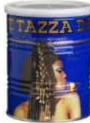
"Speciale Espresso" ground espresso 8.8 oz c